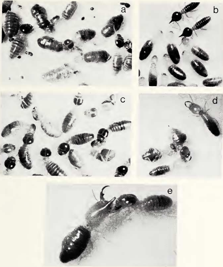
Figure 3. Termite-termite interactions (Section B). a. Nasutitermes corniger workers (dark heads) vs Amitermes chagresi soldiers (light heads). b. N. corniger soldiers vs Amitermes foreli workers. c. N. corniger intraspecific worker-worker encounter. d. Amitermes foreli soldier vs N. ephratae worker. e. Amitermes chagresi soldier vs N. ephratae worker.